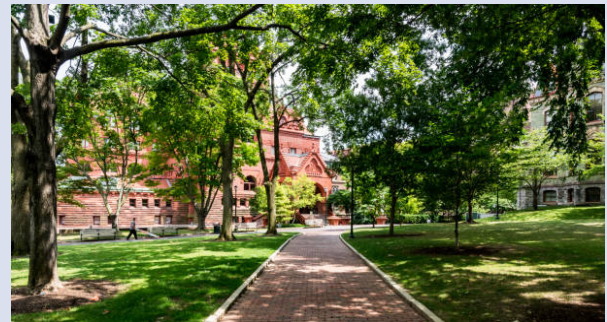
Penn's main, West Philadelphia campus is now a certified Level II Arboretum under ArbNet Certification. The Penn Campus Arboretum curates, maintains, and manages a diverse collection of trees, preserving the urban forest for the campus community.

28% Of campus is unpaved area , comprised of gardens, lawns, and pervious paving